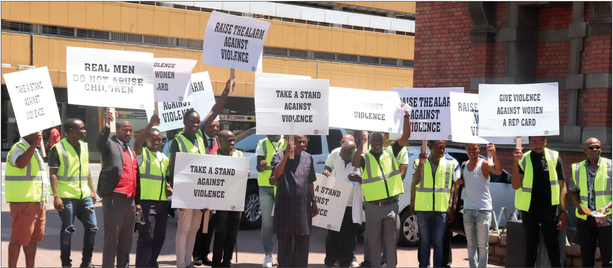
MALES demonstraing their will to protect women, children, elders and vulnerable