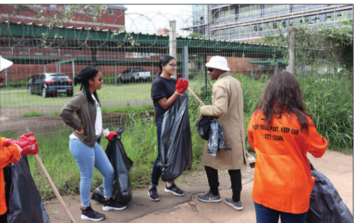
Municipality office employees in a city clean-up campaign dubbed Operation Mbo

a street-person. He said he made use of the facility in order to earn a living and survive. “A big water container costs R8 each and these are in demand amongst taxi drivers for washing their taxis,” said Mr. Xaba. He added that when they go to fetch water, they will need to go and secure buyers at taxi ranks so that they can earn their money.