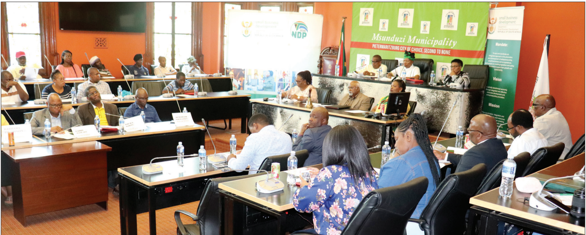
Officials from various tiers of government are seen engaging during a meeting held at the City Hall’s council chambers

Tourism and collaboration amongst national departments are signs of things to come for the Capital City