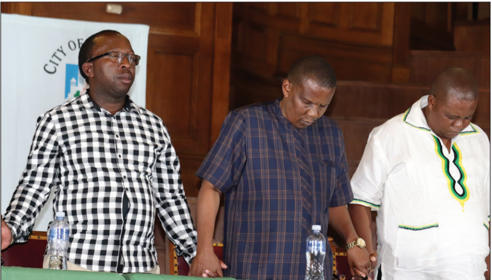
MSUNDUZI Mayor and some of the attendants in a crucial societal meeting that seeks to redress the social ills within the communities

being in agreement about the importance of this platform and committed themselves to eradicating the scourge of abuse against the most vulnerable in our society, especially