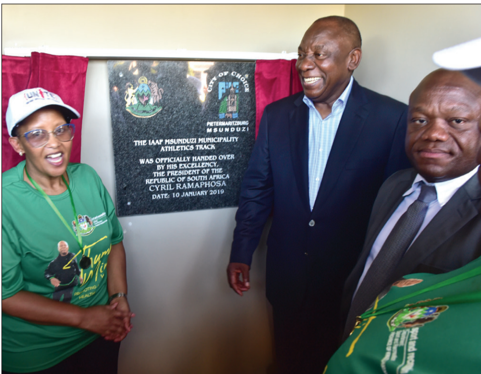
President Cyril Ramaphosa flanked by KwaZulu-Natal Acting Premier Mr Sihle Zikalala and National Sports Minister Thokoza Xasa

The State President doffs his hat to Msunduzi for being the home of sports at an international level