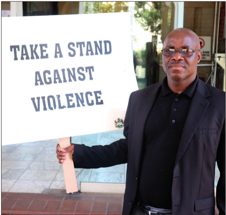
Men pledging solidarity against women abuse and the vulnerables

“To underscore the objective of this programme, we as the Zondi nation have a lot of respect for women and this is